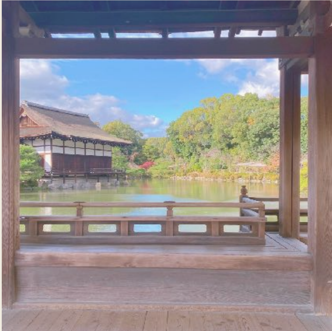
HEIAN JINGU SHRINE (平安神宮)