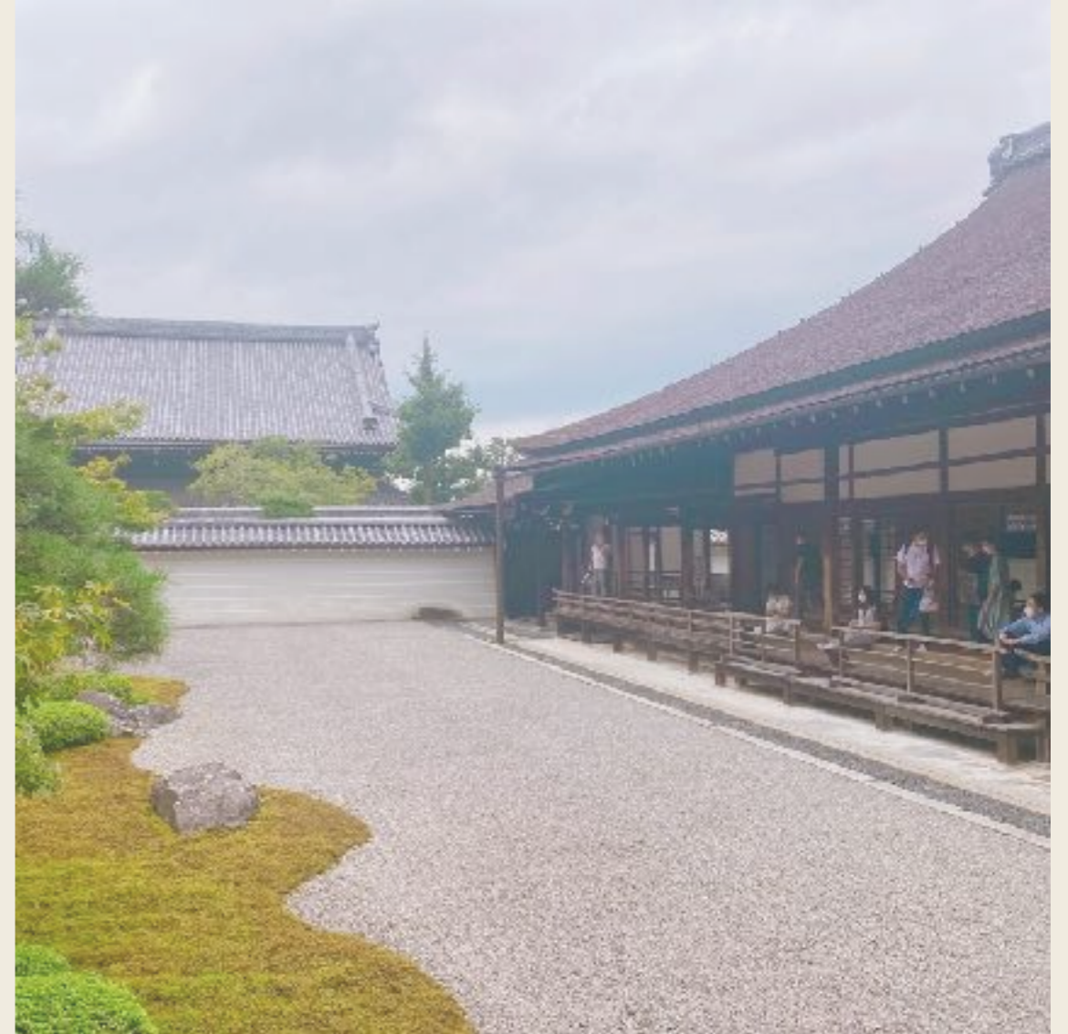
NANZENJI TEMPLE (南禅寺)